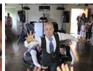
Bride is dragged off the dancefloor as groomsmen perform...