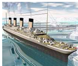
12 Animated Movies That Almost RUINED Animation