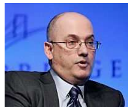
These 5 Businessmen Run The World Secretly!