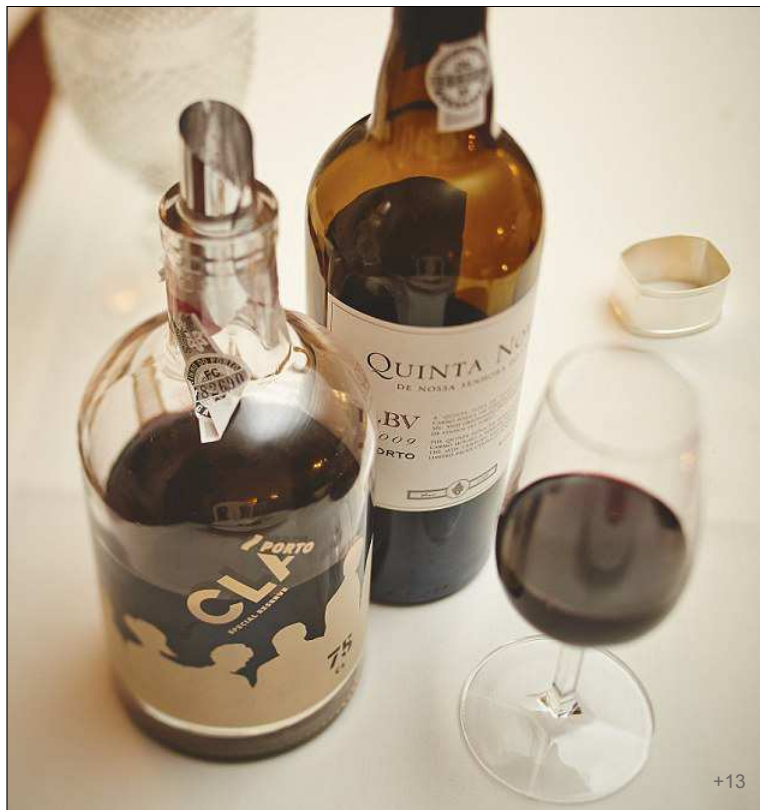
Quinta Nova has some excellent port in its cellars - don't leave without trying some