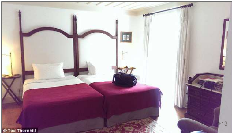
MailOnline Travel's bedroom is pleasingly homely with great views of the terrace and valley

It's dreamy, but we have to be wide awake for Ferrao, the stop that's nearest Quinta Nova, because there are no announcements to alert passengers about upcoming stations. (If you go, gather your belongings and be poised after Regua.)