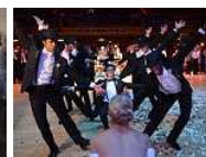
Is this the world's best synchronised groomsman dance?

Maybe Peter Jackson will chip in? Lord of the Rings fans reveal plans to build life-size replica of Middle Earth's Minas Tirith in England... but they have just 60 days to raise £1.85 BILLION