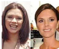
14 Celebrities Who Owe their Smiles to Plastic Surgery