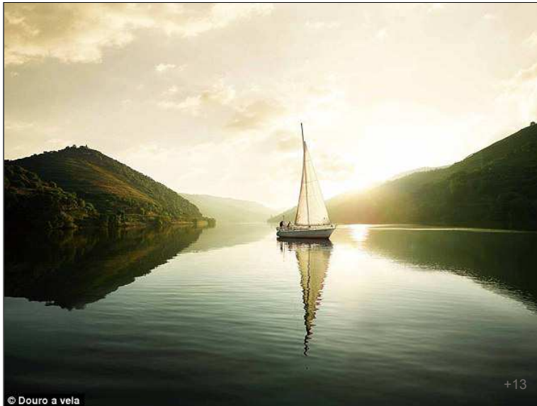
The Douro Valley is a Unesco heritage site, which comes as no great surprise. Pictured is the wonderful for-hire yacht run by Douro a vela