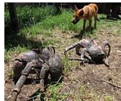
15 Terrifying Animals You Didn't Know Were REAL