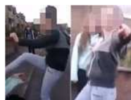
Sickening video shows bullies tormenting and beating girl