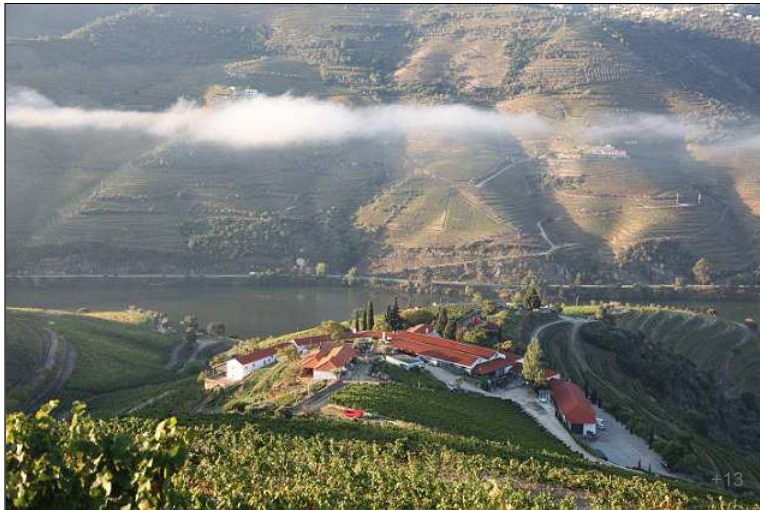
Quinta Nova is in Portugal's stunning Douro Valley - and would be a tempting hotel in an industrial wasteland. This picture shows the property nestled in its huge vineyard