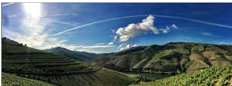
A 'quinta' is a lodge run by a wine producer - and this one belongs to one of Portugal's best. And the views from the hotel are breathtaking

For wine lovers it's a destination box that cries out to be ticked. A 'quinta' is a lodge run by a wine producer - and this one belongs to one of Portugal's best.