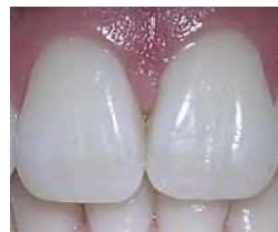
Tens os dentes amarelos? Tome medidas hoje mesmo. Branqueie os dentes em casa.