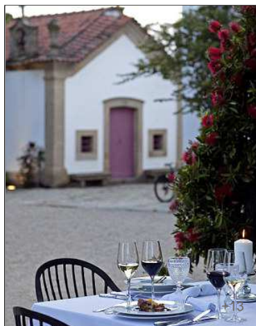
Quinta Nova can be reached by train from Porto, with the journey being spectacular once the line reaches the riverside