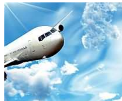
That's How You Find Super Cheap Flights!