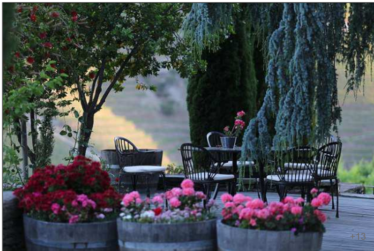
Guests at Quinta Nova can sip wine on the terrace in the most gorgeous of surroundings

We're keen to explore, but decide on lunch first. Our chef/chauffeur had boasted on the journey up that the food at Quinta Nova is getting international recognition.