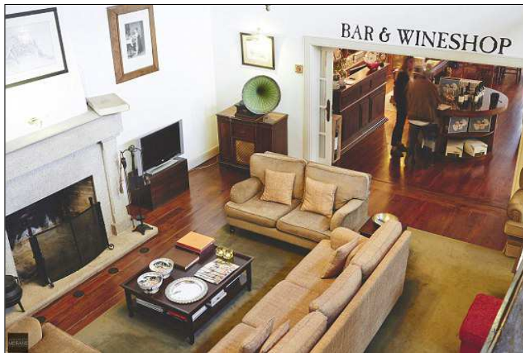
Quinta Nova has a homely feel. Think Laura Ashley with a few extras thrown in - such as a bar and wine shop