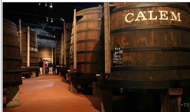
Pop into Calem for a fascinating tour and a port tasting. There's even a video presentation inside an empty barrel

Portugal is the home of port - and there's no better place to learn more about this unique, fortified red wine - mainly by quaffing the stuff, of course - than at the oldest port house in the world, Kopke.